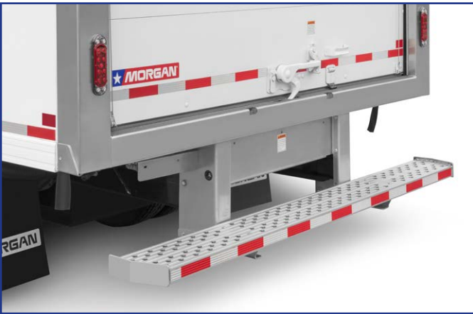
Full-Width, Easy-Access Aluminum Step Bumper