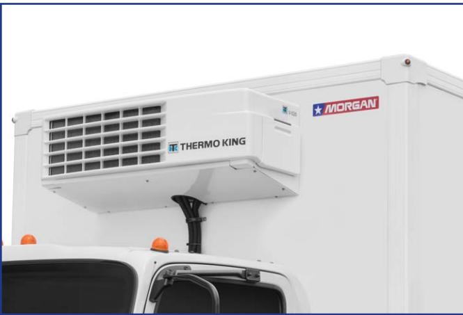
Shown w/ Optional Refrigerated Unit