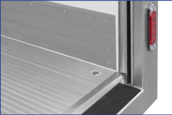
Aluminum Silent Floor