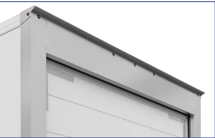
Stainless Steel Rear Frame