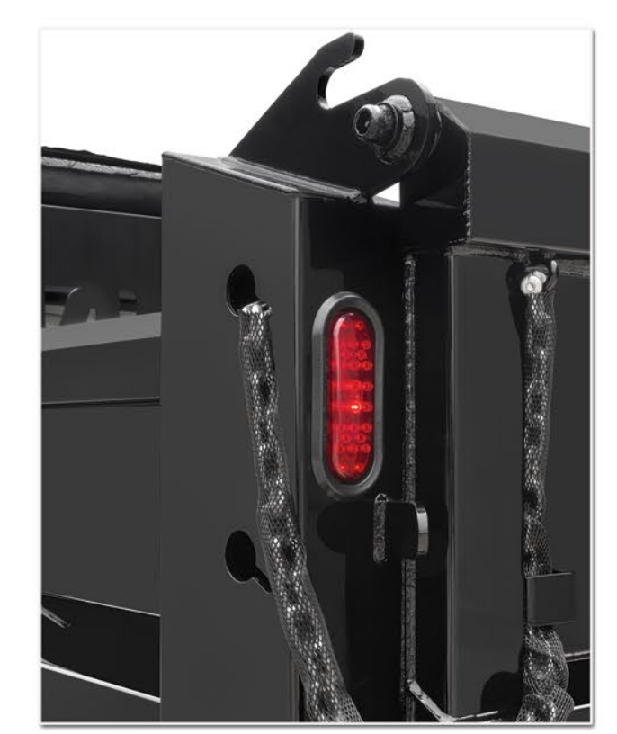
Heavy-duty mesh chain covers and redundant recessed lighting enhance safety.

Welded steel assembly, 17" high 10-and-12-gauge double sidewalls, a 10-gauge steel floor, and a 23" 12-gauge steel dump/swing gate make a Morgan body tough-enough to handle whatever the job requires. That promise is backed by Morgan's 3 Year Warranty AND a reputation for innovative design and quality construction that spans over 60 years!