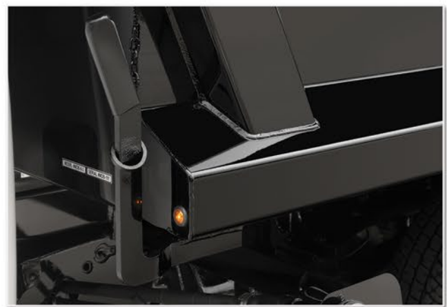
Single, and separate rubber-coated drop and swing-gate handles make it easy for one-person to release and re-secure the dump gate.