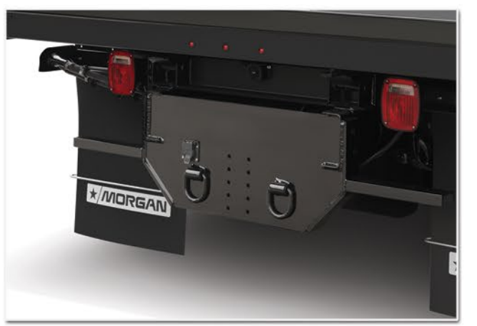
Chassis-mounted features such as the underbody bumper, hitch plate, mudflap mounts, anti-sail braces, and fuel and DEF-fill ports, minimize wear and tear on components and support greater longevity and performance.