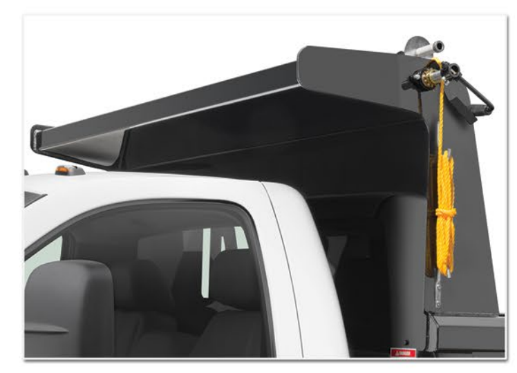
Morgan's optional bulkhead-mounted Pull-Tarp is easy to use, easy to store, and meets D.O.T. mandates for load-securement.

Morgan's heavy-duty hitch plate and tow rings make it easy to mount any hitch configuration and safely tow.