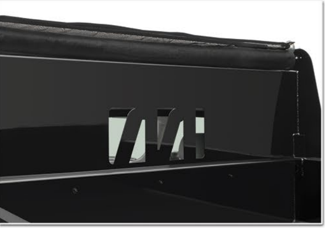
Morgan's heavy-duty steel bulkhead construction helps to protect cab and crew, while the innovative "M" pattern window supports greater visibility to the side and rear.